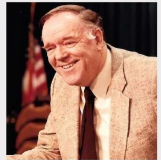
Kenneth Hagin, preacher and writer; died at 86