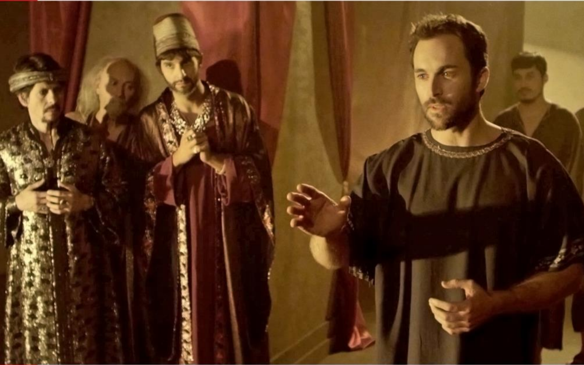
The Book of Daniel, 2013

Daniel 1:8, 9 “But Daniel purposed in his heart that he would not defile himself with the portion of the king’s delicacies, ...Now God had brought Daniel into the favor and goodwill of the chief of the eunuchs.”