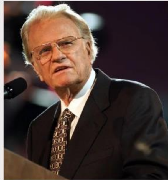
Billy Graham, evangelist; died at 99