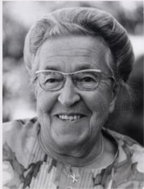
Corrie ten Boom, author and speaker; died at 91