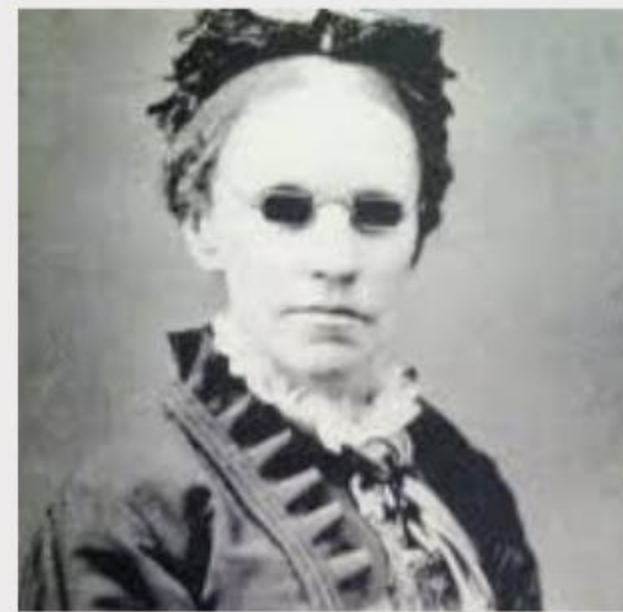
Fanny Crosby, writer of 8,000+ hymns; died at 94